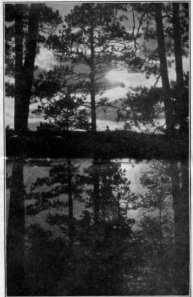
"In the Land of Heart's Desire"

Ideal Summer Camp. Squaw Point is indeed an ideal place for a lake camp. The point contains about 50 acres with a shore line of 3,600 feet. The elevation at the shore runs from two and three feet to fifteen or perhaps eighteen feet with sandy or rocky beach. Back from the shore the land rises gradually to a high plateau, affording lake view from practically every point of the tract. Old, magnificent trees cover the point. Far, far above our lowly heads their mighty branches support a canopy of green through which the summer sunshine filters. Here are burly maples with tomahawked trunks, gnarled oaks, slim, swaying elms, stately pines and shimmering splashes of silver birch, that most beautiful of all Northern Minnesota trees.