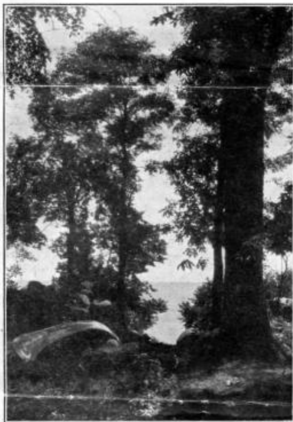
"In the Land of Heart's Desire"

In connection with every lot sold the company gives an ironclad legal guarantee. If the property is not as stated therein the company will refund every dollar paid, together with interest at 10% per annum, promptly on demand.